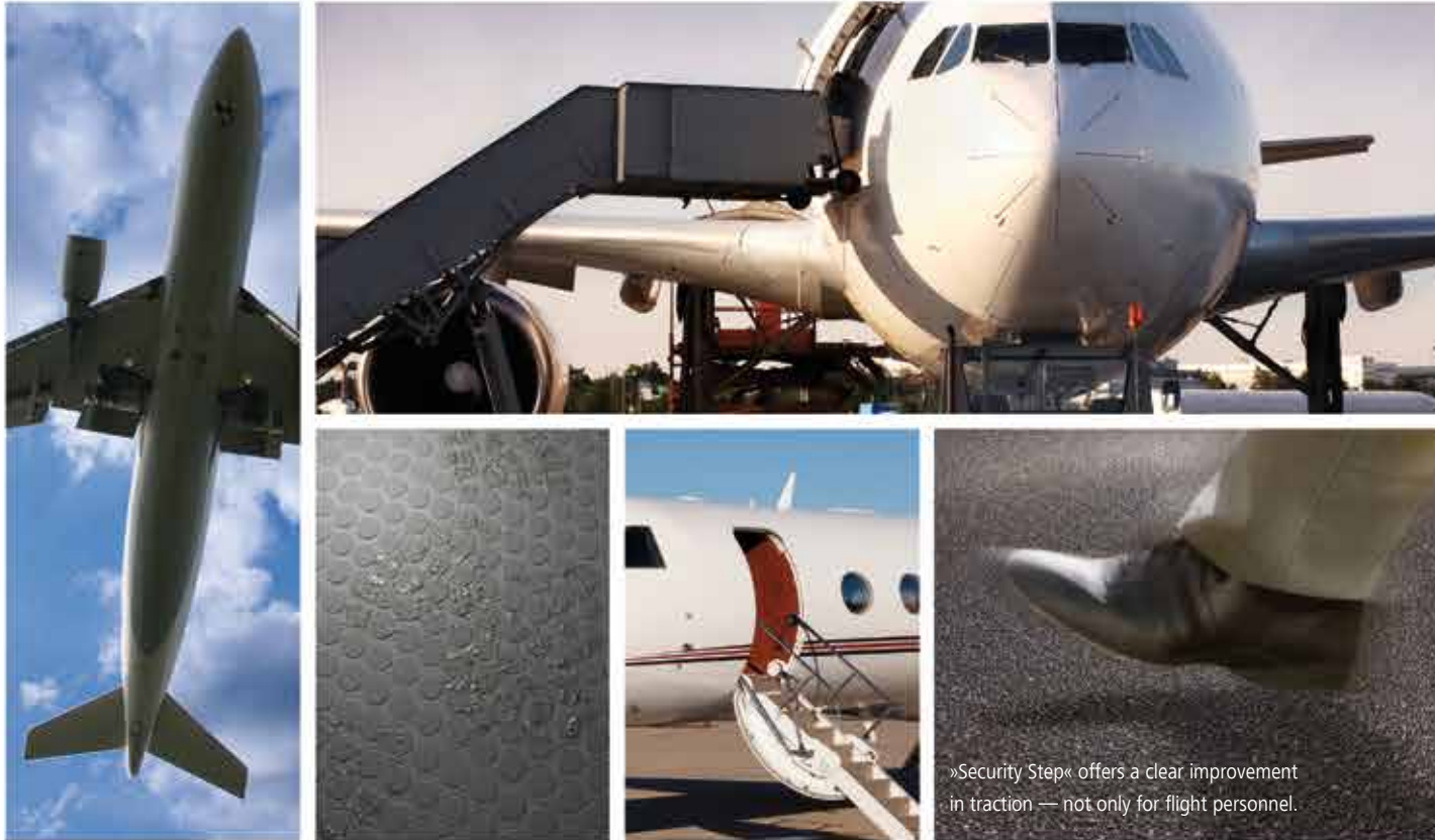
»Security Step« offers a clear improvement in traction — not only for flight personnel.